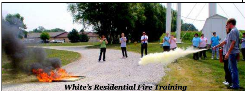
White's Residential Fire Training