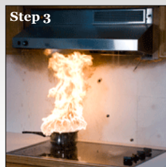
Step 3 A fusible link melts to discharge extinguishing agent.