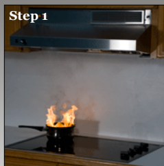
Step 1 Fan automatically turns on.

This is your BIGGEST ally against a range top cooking fire hazard!