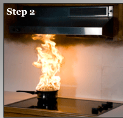
Step 2 Alarm sounds & energy source is disconnected.