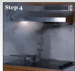
Step 4 Fire is suppressed.

There are three temperature settings which are preset by the manufacturer. As the heat reaches the first temperature, the powerful fan is automatically turned on HIGH to help dissipate heat. When the second temperature setting is reached, the control system sounds the onboard alarm and disconnects the energy source to the range - either through a gas valve or electrical disconnect. As the fire reaches the CookSafe hood surface, one of the three fusible links will melt which discharges the extinguishing agent that is sprayed over the range surface. The extinguishing agent works by blanketing the fire - cutting off its oxygen supply suppressing the fire.